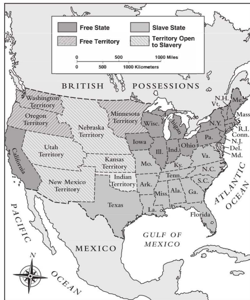
THE UNITED STATES AFTER THE KANSAS-NEBRASKA ACT OF 1854